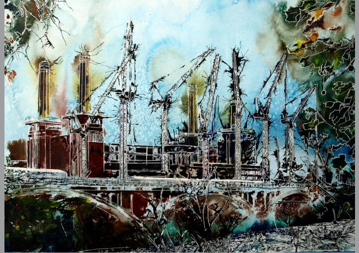
Battersea Reborn - Cathy Read