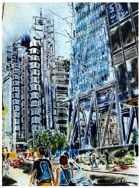
The Cheesegrater Couple - Cathy Read - 2018 - Watercolour & Acrylic

Artweeks Oxfordtimes.co.uk Oxfordshire Limited Edition May 2017 – p 10