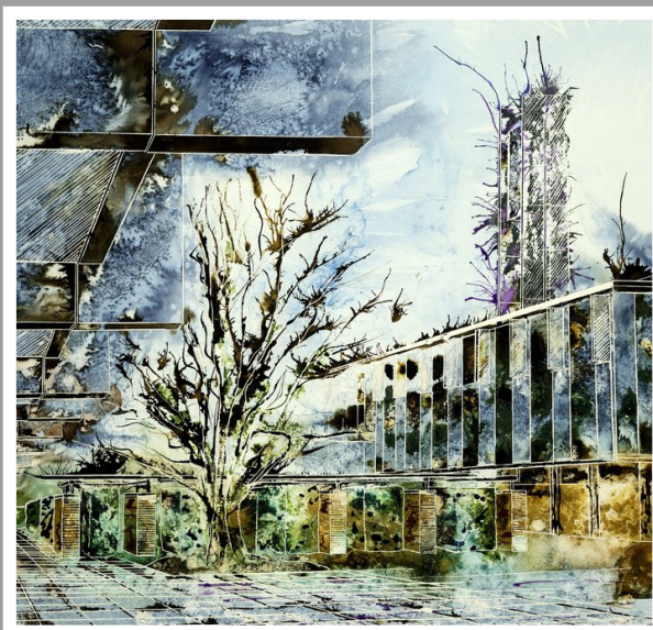
St Catherine's College - The Quad - Cathy Read - 2013 - Watercolour & Acrylic