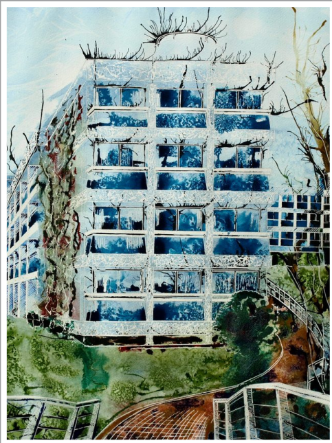
Wolfson College from Rainbow Bridge - Cathy Read 2013 - Mixed Media

Hidden Oxford: Architecture and Aquatints – Esther Lafferty – Art – Ox Magazine – September 2017, p 44 https://estherlafferty.wordpress.com/2017/09/10/art-hidden-oxford-architecture-and-aquatints/