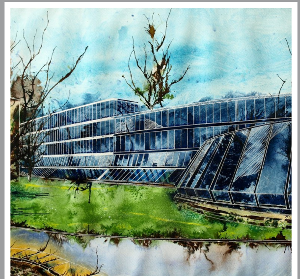
Keble College - The Spaceship, Oxford - Cathy Read - 2013 - Watercolour & Acrylic

Hidden Oxford: Architecture and Aquatints – Esther Lafferty – Art – Ox Magazine – September 2017, p 44 https://estherlafferty.wordpress.com/2017/09/10/art-hidden-oxford-architecture-and-aquatints/