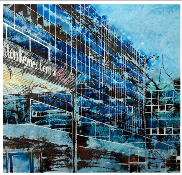
Destination Anywhere - Cathy Read - 2012 - Mixed Media

"It was with this in mind that Cathy embarked on the Milton Keynes Project, in 2012. Through a series of painting and a book, she aimed to celebrate the much-maligned city and show that it was so much more than a carbuncle."